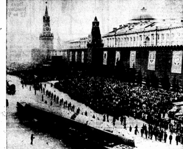
Biggest "gun" in the Soviet arsenal passes through Red Square in Moscow Sunday as the Russians celebrate the 20th anniversary of Victory in Europe Day. It's a 130-foot, three-stage, solid-fuel rocket with intercontinental nuclear capabilities.

"This is a serious warning for those who would start to try to follow Hitler's example. The people will utilize all their strength in order to stamp out their domination."