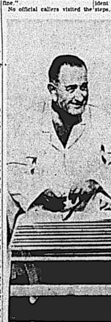
President Johnson, outside for the first time since his operation, relaxes with Mrs. Johnson on the sun deck of the Bethesda Naval Hospital Thursday.